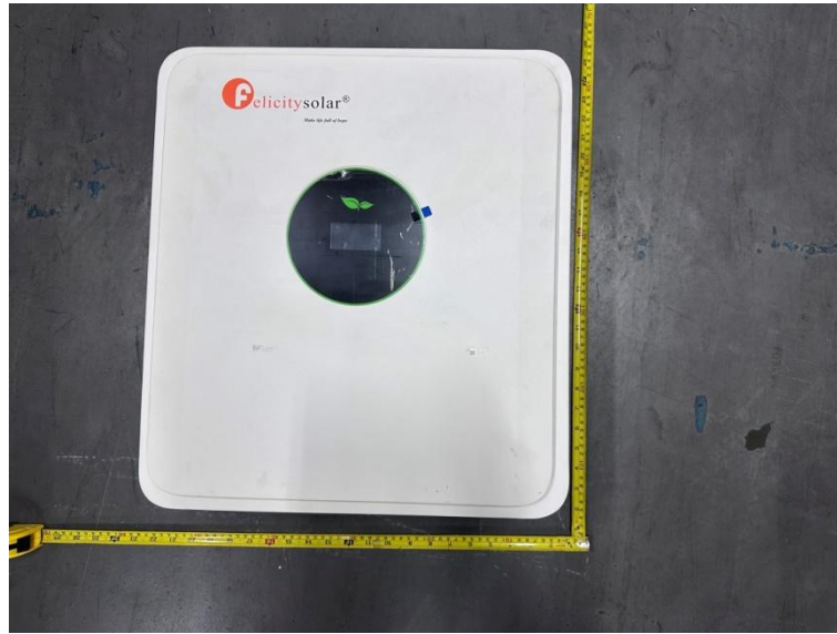
Battery: FLA24171-EU, 25.6V, 171Ah, 4.4kWh